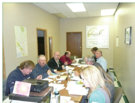
REDI Members-April 2009 Board Meeting